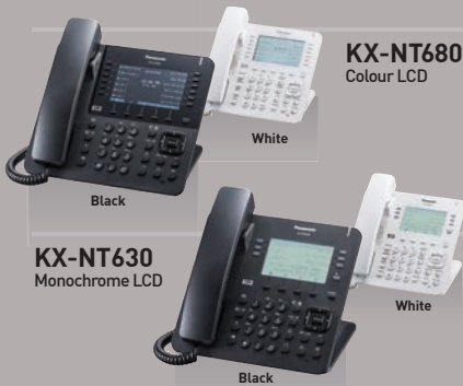
KX-NT680 Colour LCD