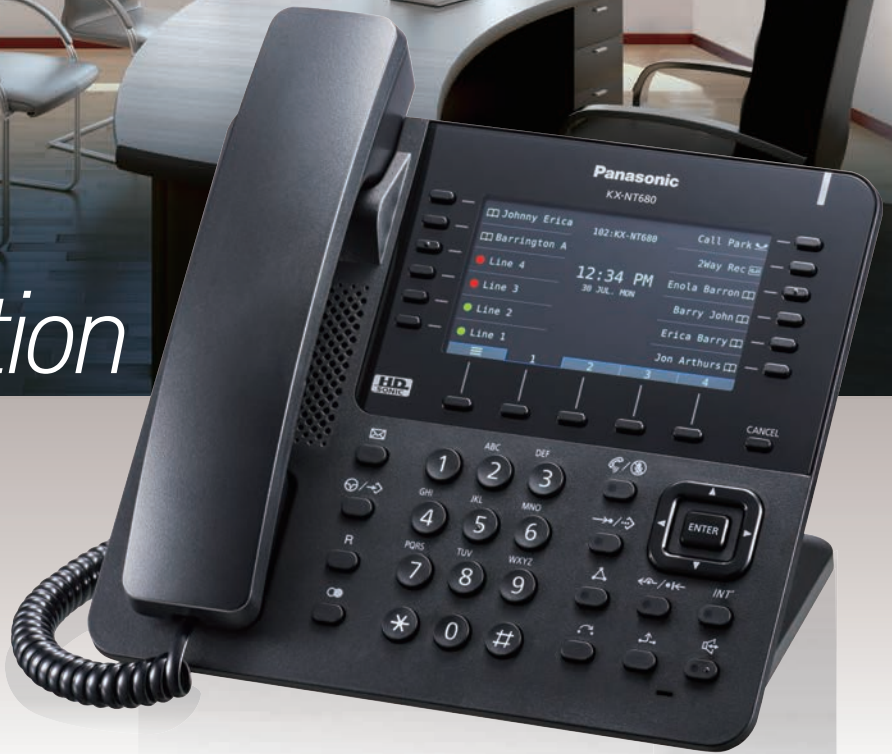
HD SONIC KX-NT680 Colour LCD

With the ever-changing business world in mind, at Panasonic we created a new type of communication equipment, ready for the future. Using a clear colour LCD, integrating High Definition Audio and an enhanced user interface, we provide for the needs of current users.